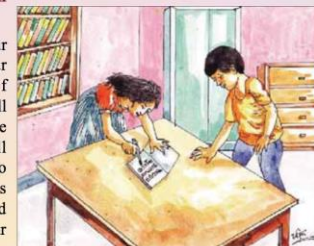
A child is writing the ways to be tolerant of others opinion

taken but for that we should not be sad. In fact respecting the opinion of the majority, we have to work with an open mind.