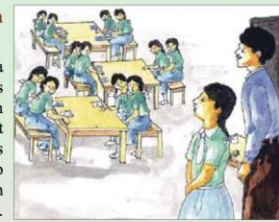
A child is saying something in the class and others are listening to her attentively

When we express our opinion on a particular matter, a number of opinions are formed. But all the opinions cannot be taken together. Among all these opinions, we have to take the opinion which is given by the majority and good for all. Sometimes our own opinion may not be